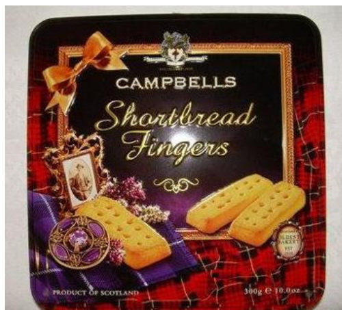
Delicious Holiday Biscuits