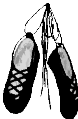
Clans has extended its hours!